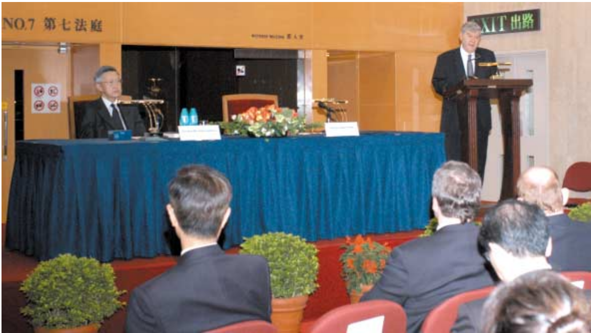
以色列最高法院院長巴哈龍·巴拉克主講「司法酌情決定權的性質」 The Honourable Aharon Barak, President of the Supreme Court of Israel, gives a talk on "The Nature of Judicial Discretion"

In April 2005, the Honourable Aharon Barak, President of the Supreme Court of Israel, gave a talk on "The Nature of Judicial Discretion" to our judges. Members of the legal profession, as well as the teaching staff and students of the law schools at the local universities also attended.