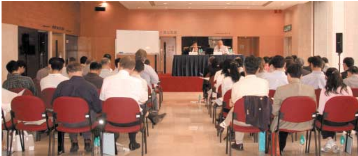
區域法院民事案件講座 District Court Seminar on Civil Matters

此外，我們亦在2005年12月舉行裁判官會議，討論「勞資傳票的量刑方針」、「永久擱置法律程序與司法覆核」及「自殺和防止自殺概況」等課題，共有50位法官和司法人員參加。